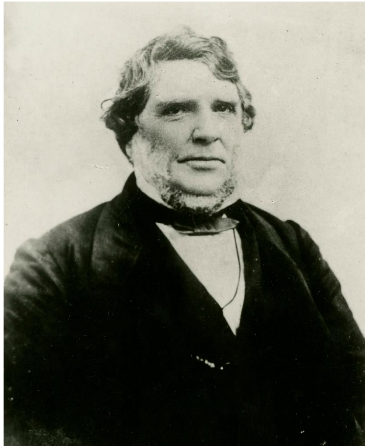
William Kennish