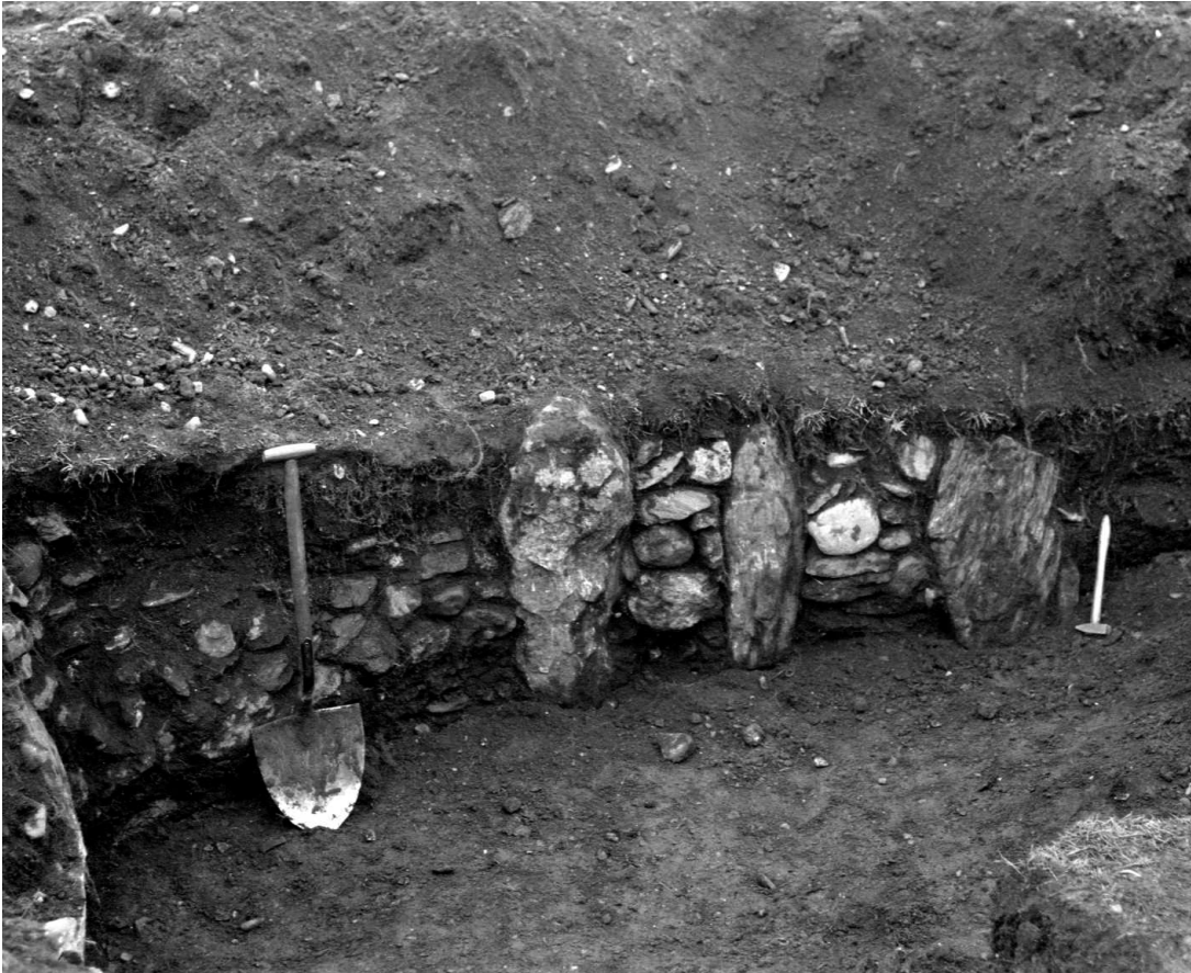
FIG. 30.—Southern Wall of small Fort on top of the Cronk-Howe-Moor.

have been a gap, or step, forming an entrance. In short, we excavated a rectangular area of about 18 ft. by 10 ft., surrounded by the revetment wall and extending to about 4 ft. below the present surface of the ground—evidently the inside of a small fort or primitive defensive work on the summit of this strongly-placed mound in the marsh.