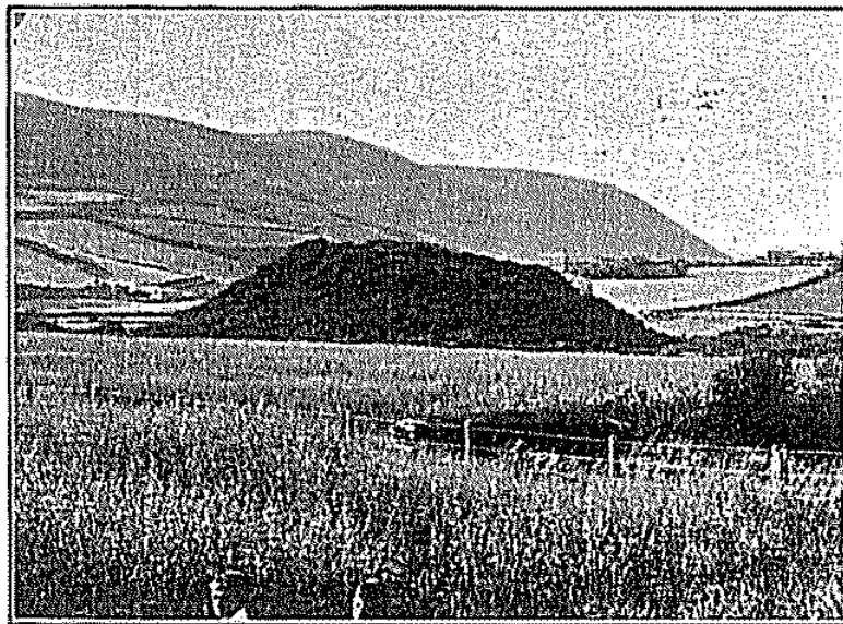
FIG. 28.—Distant view of the Cronk-Howe-Mooar, from the South-East.