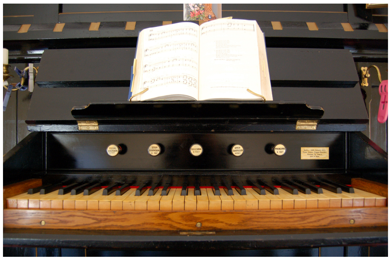
Gt: 8,8,8,4, Ped: 16.

The builder of this tiny instrument is unknown, but whoever it was had a sure sense of style in its outward appearance, and was skilled in the organ-building practices of their day. Originally built without pedals, this may well have been a chamber organ intended for a private